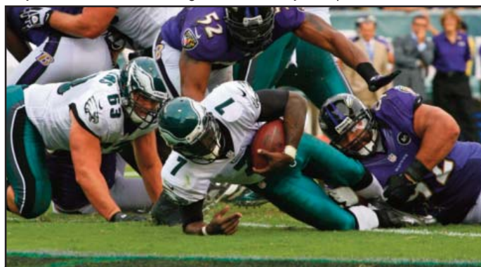
Michael Vick led the Eagles on a 10-play, 80-yard drive and scored the game-winning touchdown with 1:55 remaining in the contest.

Notes: Celek moved into fourth place all-time among Eagles tight ends with 235 career receptions...Celek and Jackson both tallied 100+ yards receiving, the first time an Eagles duo has each notched 100+ plus yards since they both did so on 9/20/09...The Eagles defense has held their opponents to 6-27 (22%) on third downs through the first two games...Philadelphia became the first team in NFL history to win their first two games, each by one point.