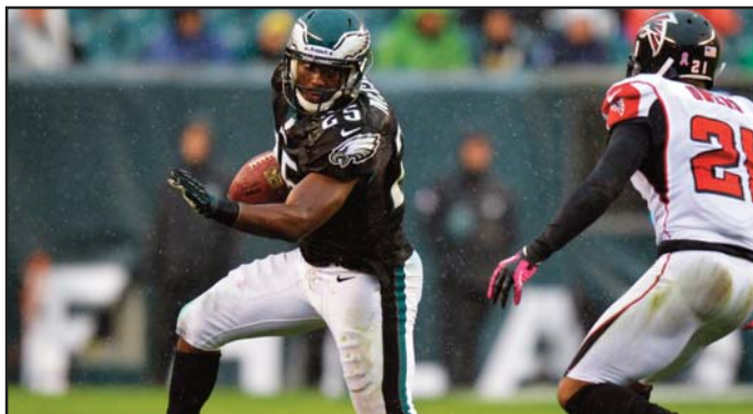
RB LeSean McCoy scored two touchdowns (1 rushing and 1 receiving). It was his fourth time scoring via rush and reception in the same game.