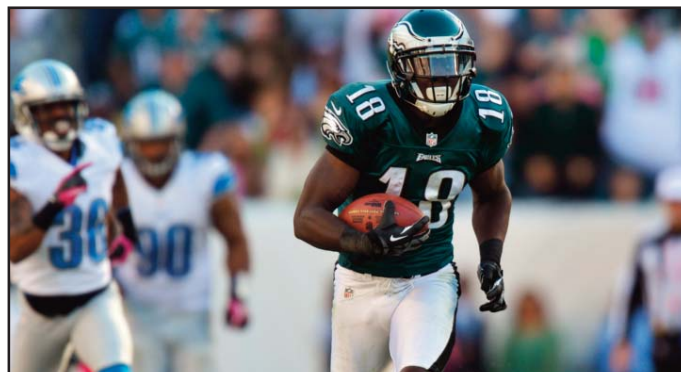
WR Jeremy Maclin scored on a 70-yard touchdown pass from QB Michael Vick to put the team up 23-13 in the fourth quarter.