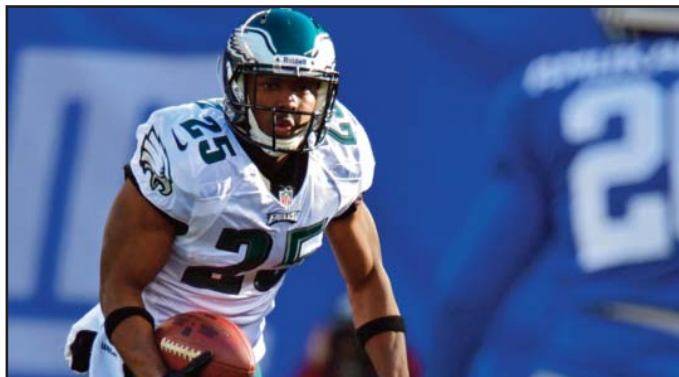
RB LeSean McCoy led the team with 106 total yards from scrimmage.