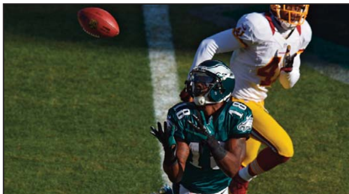
Wide receiver Jeremy Maclin led the team with 116 receiving yards on 8 catches, including this 27-yard touchdown grab from QB Nick Foles.