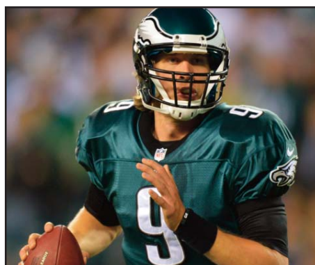
Rookie Nick Foles came in for an injured Michael Vick and completed 22 of 32 passes for 219 yards, including a 44-yard TD to Jeremy Maclin.

FIELD GOALS: EAGLES - A.Henery (40G) ... COWBOYS - D.Bailey (30G)