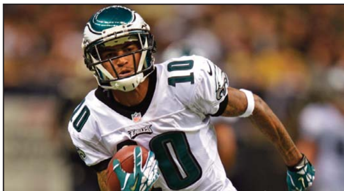
DeSean Jackson hauled in a 77-yard touchdown pass from Michael Vick and reached the 100-yard receiving plateau for the 15th time in his career.