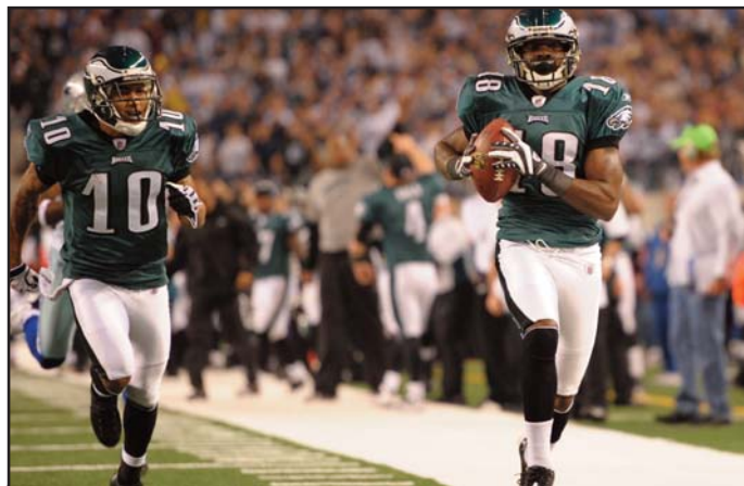
Jeremy Maclin set an NFL rookie postseason record with 146 receiving yards and his 76-yard TD catch from Michael Vick was the longest pass play in franchise postseason history.

Notes: Vick's 76-yard TD pass to Maclin was the longest in the team's postseason history, besting Jeff Garcia's 75 yarder to Donte Stallworth at New Orleans on 1/13/07 ... Maclin's 146 receiving yards were the most ever by a rookie in NFL postseason history and the most by an Eagle in the playoffs, topping TE Keith Jackson's 142 in the "Fog Bowl" at Chicago on 12/31/88. The 21-year-old Maclin became the youngest player in NFL history to catch a touchdown pass ... K David Akers played in his 18th playoff game, tying Brian Dawkins for first place on the team's all-time list.