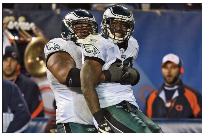
Nick Cole bearhugs LeSean McCoy after his game-winning touchdown run

Notes: Akers became the 28th player in NFL history to kick 250 field goals ... McNabb tied Ron Jaworski (142) for most regular season games played by a quarterback in Eagles history ... Eagles CB Asante Samuel played in his 100th career regular season game ... Dixon's field goal block was the first by the an Eagle since Trent Cole did so on 12/7/08 at NYG ... Philadelphia won for the first time on NBC Sunday Night Football after dropping their first seven such contests