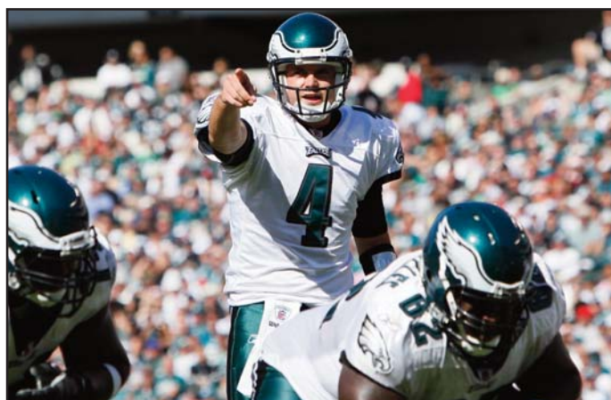
Kevin Kolb fired for 391 passing yards and two TDs in his first NFL start

Notes: Kolb's 391 passing yards were the 12th-highest total in team history and the most by an Eagle since McNabb threw for 464 on 12/4/04 vs. Green Bay. It was also the highest yardage total ever for an Eagles quarterback in his first NFL start ... Jackson's 71-yard TD catch was the longest of his career ... Jackson and TE Brent Celek each topped the 100-yard mark in receiving yards, becoming the first WR/TE tandem to do so in one game for the Eagles since WR Terrell Owens and TE L.J. Smith reached the century mark on 9/18/05 vs. San Francisco ... The last time multiple Eagles topped the 100-yard receiving mark in the same game was in the 2008 home opener vs. St. Louis (Jackson, WR Greg Lewis and WR Hank Baskett).