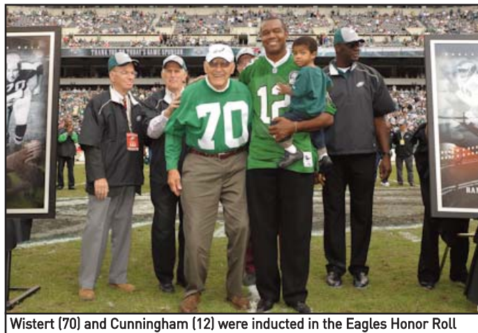
Wistert (70) and Cunningham (12) were inducted in the Eagles Honor Roll

Notes: At halftime, Randall Cunningham and Al Wistert were inducted into the Eagles Honor Roll ... Jackson became the first NFL player to post a 60-plus yard play in three consecutive games since the Chiefs Dante Hall in 2003 (four straight games) and the first Eagle to do so since Jack Ferrante in 1945 ... Jackson also became the first Eagle since 1985 (Mike Quick) to have 60-plus yard TD receptions in consecutive games ... Jackson and Celek became the first Eagles duo to notch 100-yard receiving games in back-to-back games since Pete Pihos and Bobby Walston in 1953 ... In fact, Celek became the first Eagles tight end to post back-to-back 100-yard receiving games since Pete Retzlaff did so in 1965 ... The Chiefs were 0-11 on third down opportunities ... Vick became the 2nd left-handed QB to throw a pass in team history joining Allie Sherman ... Kevin Kolb was named NFC offensive player of the week for his performance.