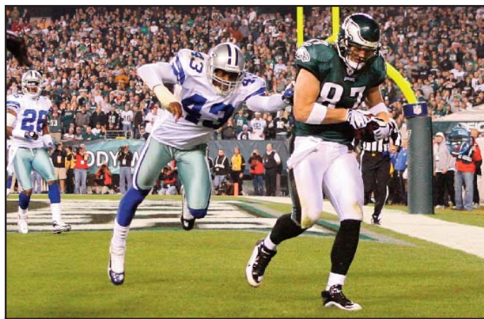
Brent Celek snags an 11-yard TD from Donovan McNabb in the 3rd quarter

Notes: Including playoffs, this game represented the 100th all-time meeting between the Eagles and Cowboys ... Akers nailed three field goals of 40+ yards in a game for the 2nd time this season and the 5th time in his career (including playoffs) ... Eagles S Quintin Mikell played in his 100th regular season game.