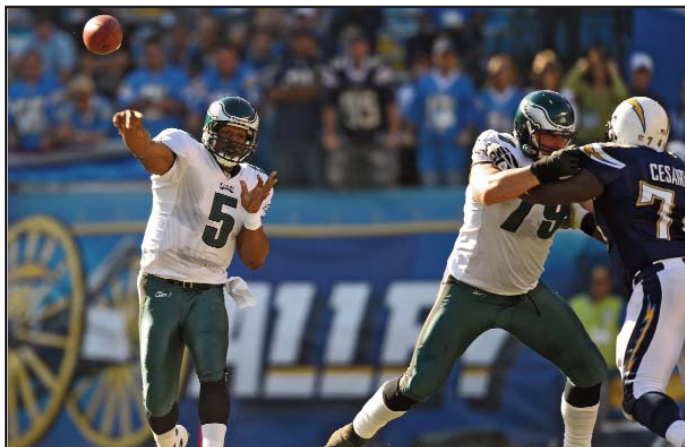
QB Donovan McNabb threw for 450 yards in the Eagles comeback attempt