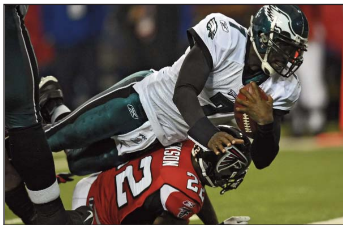
Michael Vick scores his first touchdown of the season in the decisive win

Notes: The Eagles became the 13th team in NFL history to post 100 regular season wins in a decade ... Vick's TD run was his first since 10/15/06 vs. NYG at the Georgia Dome and his touchdown pass was his first since 12/31/06 at Philadelphia's Lincoln Financial Field ... Sheldon Brown set a career high with his 5th INT of the season and posted the longest INT return of his career (83 yards) ... Atlanta played without five offensive starters including QB Matt Ryan and RB Michael Turner, while the Eagles played without offensive stalwarts Brian Westbrook and DeSean Jackson ... The Falcons lost at home for just the 2nd time since the start of the 2008 season ... Eagles FB Leonard Weaver accounted for 100 yards of total offense (37 rushing and 63 receiving)