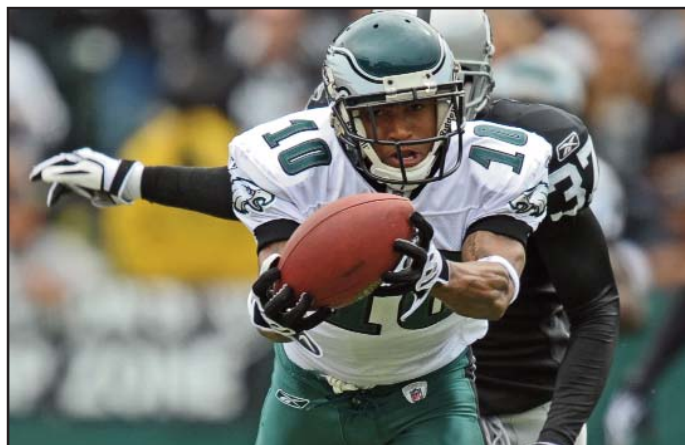
DeSean Jackson hauls in a 51-yard pass from Donovan McNabb

Notes: Eagles RB Brian Westbrook moved past Steve Van Buren (5,860) and into 2nd place on the Eagles all-time rushing list ... The Eagles made their first visit to Oakland since September 24, 1995 ... Eagles CB Asante Samuel posted his 30th career interception.