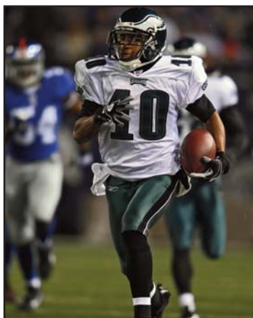
DeSean Jackson takes a punt and races down the sideline for a 72-yard touchdown. It was the first of his two 50-plus-yard scores in the game