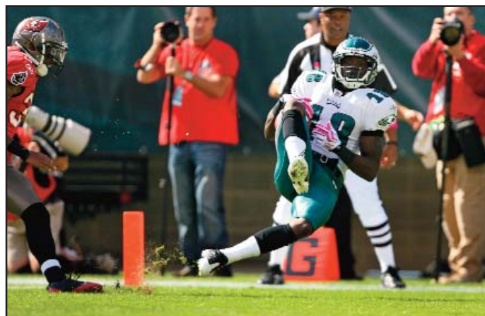
Rookie Jeremy Maclin hauls in one of his two 40+ yard touchdown catches

Notes: Eagles coach Andy Reid became the 34th head coach in NFL history and the first in team history to post 100 regular season victories ... Maclin became the first Eagles rookie ever to post two 40-plus-yard TD receptions in the same game. His 142 receiving yards were the third most by a rookie in club history behind Don Looney (180 on 12/1/40 at Washington) and Hank Baskett (177 on 12/31/06 vs. Atlanta) ... Akers connected on four PAT attempts to become the franchise's all-time leader ahead of Bobby Walston (365) ... Samuel's two-INT performance was the 5th multi-interception game of his career and his first as an Eagle ... Trent Cole notched his 38th career sack, moving ahead of Seth Joyner (37.5) for 6th place on the Eagles all-time list.