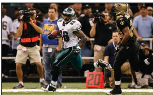
Brian Westbrook's 62-yard touchdown run was the longest in Eagles playoff history and gave the Eagles a 21-13 lead.

EAGLES TURNOVER RATIO: +1 (0 fumbles, 0 INTs/1 fumble, 0 INTs)