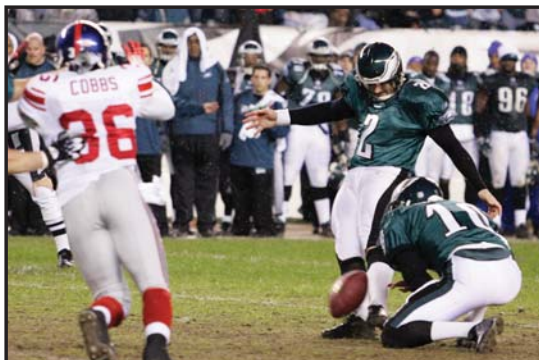
David Akers nailed a game-winning, 38-yard field goal as time expired to win the game for the Eagles.