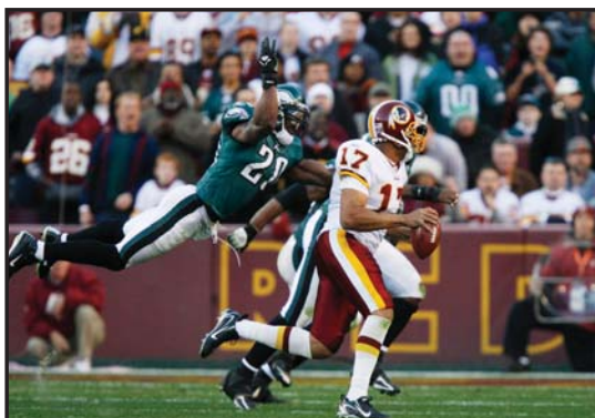
Brian Dawkins made high-flying, havoc-wreaking plays like this sack which forced the Redskins to settle for a field goal with 4:25 remaining in the game, preserving an Eagles win.

EAGLES TURNOVER RATIO: +1 (1 fumble, 0 INTs/o fumbles, 2 INTs)