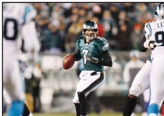
On Monday Night Football, Jeff Garcia passed for 312 yards and 3 touchdowns in his first home start as an Eagle.

EAGLES TURNOVER RATIO: +2 (0 fumbles, 0 INTs/o fumbles, 2 INTs)